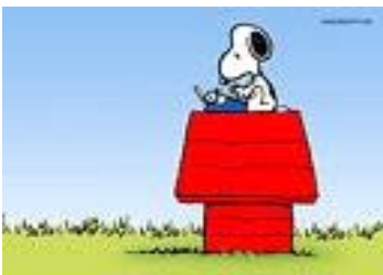
From our news correspondents.....